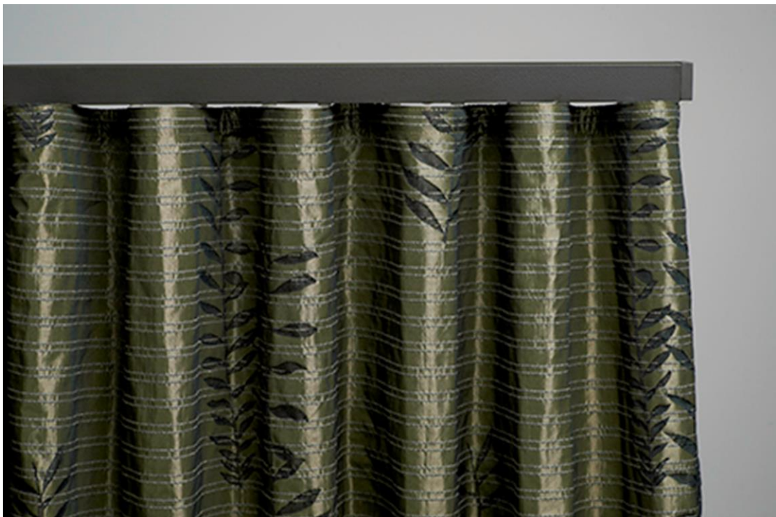
Rod: 32mm Square Rod with S-fold - RIVERSTONE