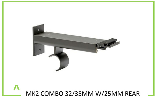
MK2 COMBO 32/35MM W/25MM REAR