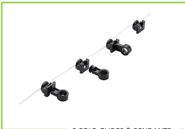
S-FOLD GLIDES & PENDANTS

This is a three-piece option consisting of the backing tape (25mm wide) which is sewn to the fabric, the workroom or installer then presses the pendant onto the stud, which is then secured into the glide at installation (double snap).