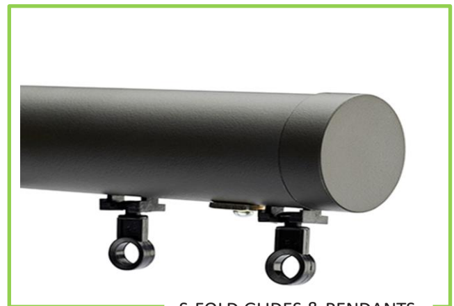
S-FOLD GLIDES & PENDANTS - 35MM RIVERSTONE ROD W/END CAPS