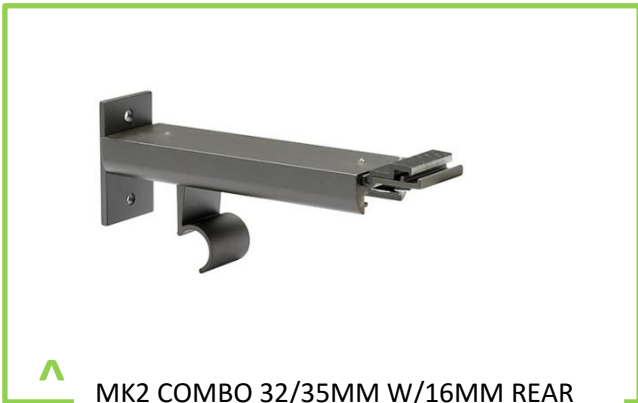
MK2 COMBO 32/35MM W/16MM REAR