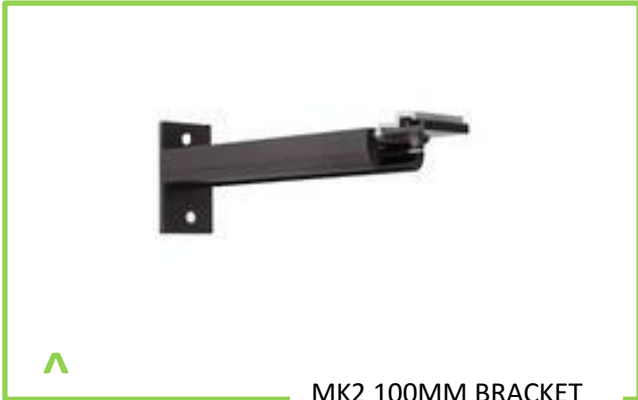
MK2 100MM BRACKET