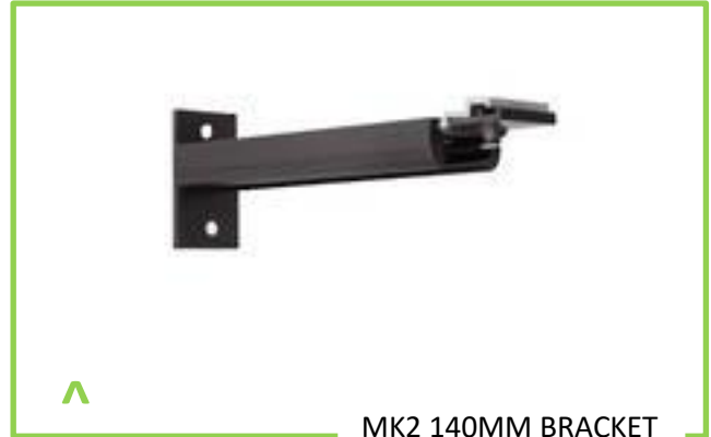
MK2 140MM BRACKET