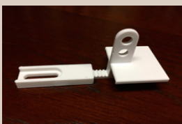
FLUSH FIT END STOP