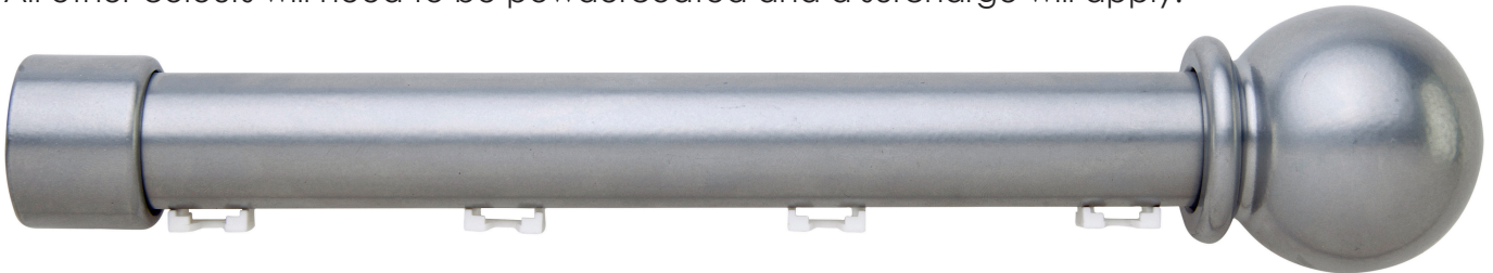
25mm Wave Rod w/Plain Cap and Medium Ball finials

All other colours will need to be powdercoated and a surcharge will apply.